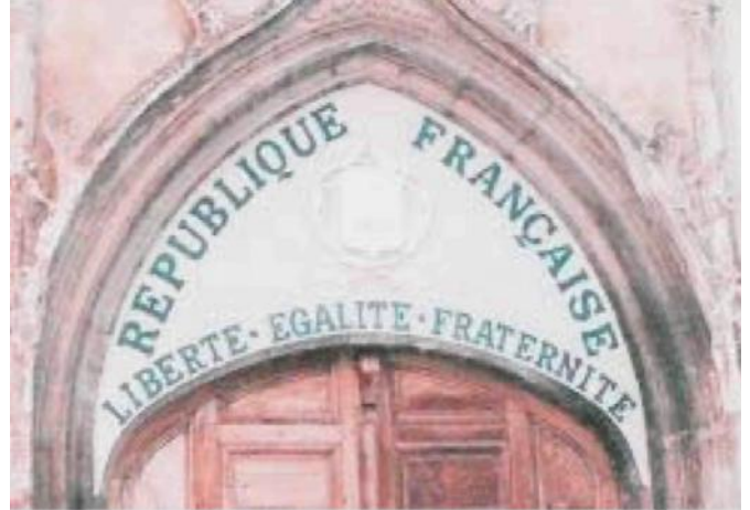
Jakoben laikliğin neye benzediğini en iyi gösteren resimlerden biri budur: Fransa'da bir kilise; kapısında Fransız Cumhuriyeti ve eşitlik kardeşlik özgürlük yazılı

"The first of the principles of French Republic is freedom; The first of the freedoms is the freedom of conscience; to support religion monetarily is insisting something to the citizens other than their own beliefs and it is unethical;