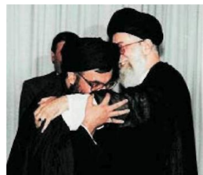
Nasrallah ve Hameney

What is certain is that Hezbollah is not the party that will open the way to the liberation of Palestine. On the contrary, it is more appropriate to say that it is suitable for the role estimated for the repentant Islamic Currents in the Big Middle East Project of USA.